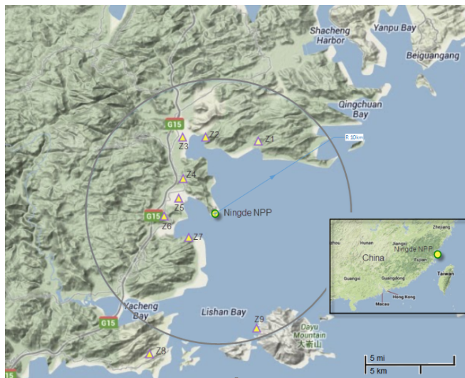
Fig. 1. (Color online) Location of Ningde NPP and on-line monitoring stations of the surveillance system (Z1~Z9).

Ningde NPP is located in Fuding, Ningde of Fujian Province, 32 km south of Fuding, face the East China Sea on the east, and Taiwan is situated on the southeast across Taiwan Strait. Fig. 1 shows the site location of the NPP. The first stage of the NPP is to build four pressurized water reactors of CPR 1000 (Chinese Pressure Reactor 1000), and the first reactor was put into commercial operation on Apr. 18, 2013.